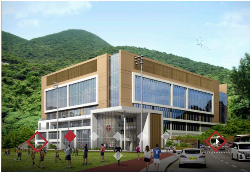
TAI TAM CAMPUS DRAGON CENTER FOR ACTIVITIES & ATHLETICS