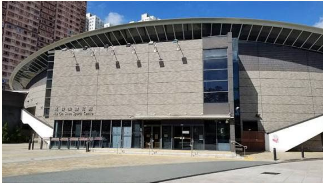
MA ON SHAN SPORT CENTER (HONG KONG)